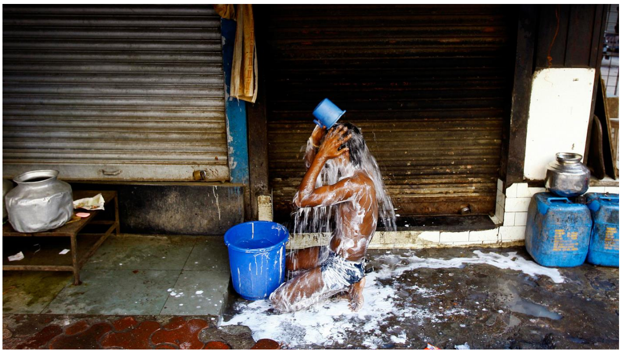
A young man bathing self in his home in India.