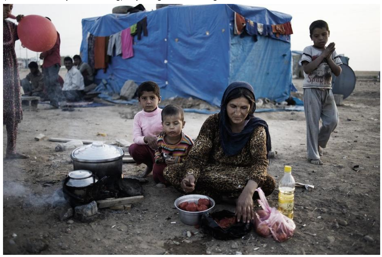
This photo shows a Syria refugee camp.